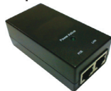
PoE Injector A

For installations with AC power available