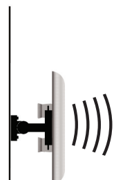
Wall Mount (Optional - GMT25)