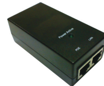
PoE Injector A (x 2)