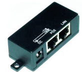
PoE Injector B (x 2)