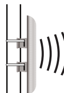
Pole Mount (Standard)