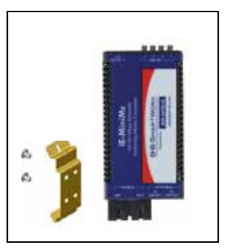
Figure 2. DIN Rail Mounting

The DIN Rail clips include screws, to allow the installation onto a DIN Rail. Install the screws into DIN Rail clips, which should be mounted parallel or perpendicular to the DIN Rail. Snap the converter onto the clips. To remove the converter from the DIN Rail, use a flat-head screwdriver into the slot to gently pry the converter from the rail.